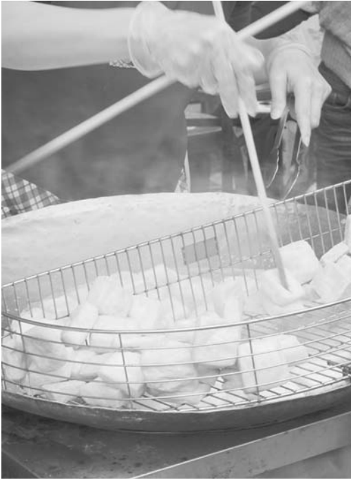
Traditional Taiwanese snack of stinky tofu.